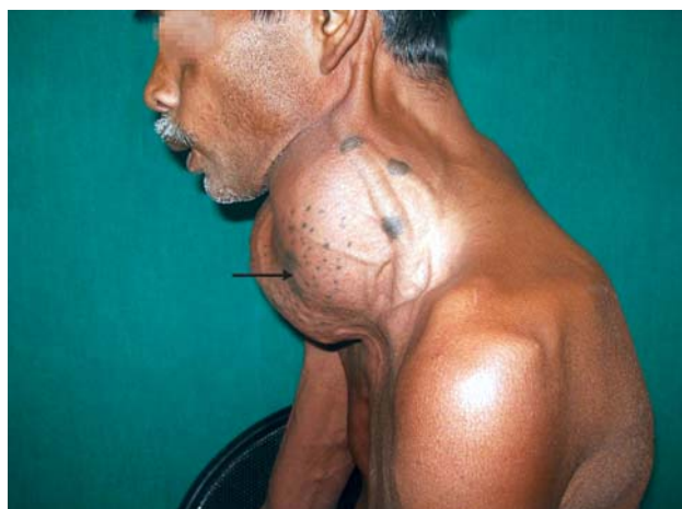
Fig. 2: Side profile of same patient (arrow showing tattoo marks)