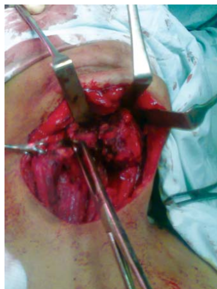
Fig. 2: Intraoperative picture of Sistrunk's procedure for carcinoma of thyroglossal duct cyst

review of 115 cases, 1% was reported to develop malignancies. 10 This figure of 1% has been quoted elsewhere in literature. 7,11,12 The commonest malignancy is papillary carcinoma and accounts for 80 to 85% of cases. 5,10,12-14 The concomitant occurrence of papillary carcinoma in the thyroglossal duct and thyroid have also been reported. 10 In the literature review by Weiss and Orlich, 11.4% of 115 cases had concomitant carcinoma of the thyroid. In our case series, 44.4% had concomitant carcinoma in thyroglossal duct and thyroid. The prognosis for papillary TGDC is excellent, with occurrence of metastatic lesions in less than 2% of cases. 5