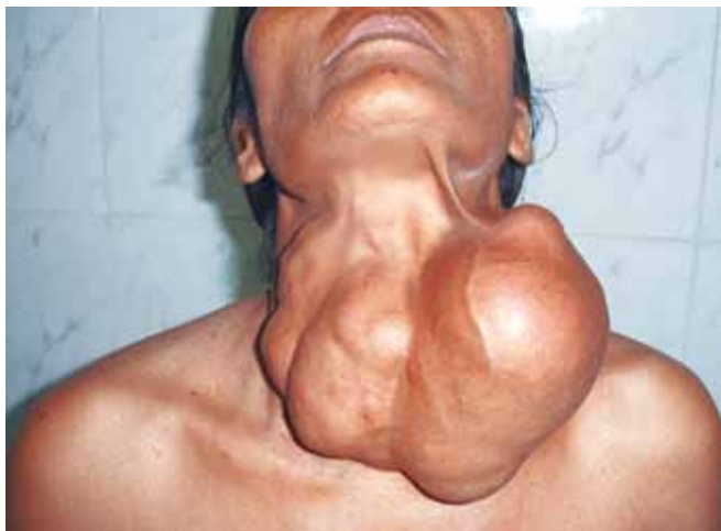
Fig. 2: Longstanding multinodular goiter