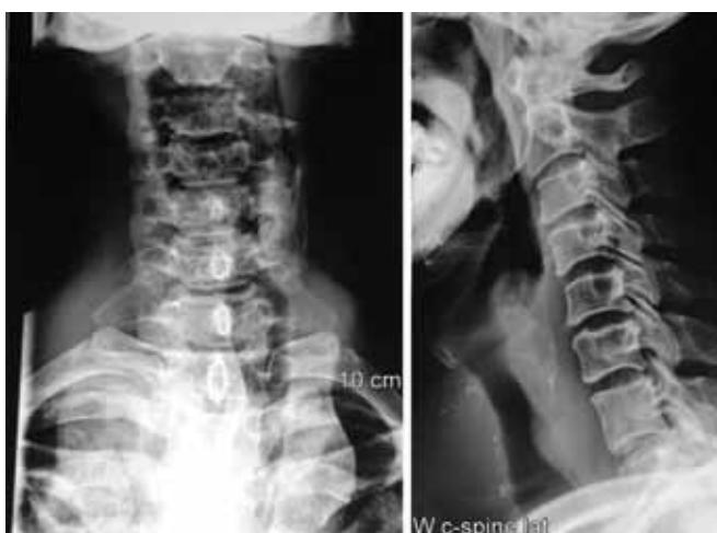
Fig. 3: X-ray showing tracheal narrowing and also retrotracheal extension

The important point is recognition of tracheomalacia on the operating table before extubation. There is no single fool-proof criterion for confirming a diagnosis of tracheomalacia. However, for the intraoperative diagnosis of tracheomalacia, we have taken one or more of the following criteria: