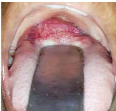
Fig. 1: A large, fleshy mass in the base of tongue with numerous congested vessels on the surface