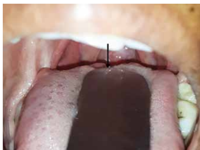
Fig. 4: Reduction in size of lingual thyroid post antithyroid drug therapy with carbimazole. Residual lingual thyroid mass postantithyroid therapy showing significant reduction in size of the mass (black arrow)

pericardial sac, heart, breast, duodenum, mesentery of the small intestine and adrenal gland. 2 Most cases of lingual thyroid are associated with hypothyroid or euthyroid status; only a few cases of lingual thyroid with hyperthyroidism or Graves' disease have been reported in literature. 2-4 Lingual thyroid has been reported less commonly in children, and all reported cases of pediatric lingual thyroid were seen to be associated with hypothyroidism. 5,6