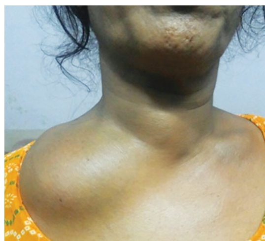
Fig. 1: Preoperative view of patient with right solitary thyroid nodule and right clavicular mass

She was planned for a surgery followed by adjuvant whole body radioactive iodine therapy.