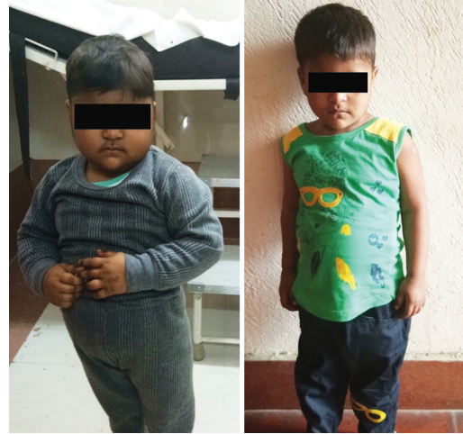
Fig. 1: Preoperative and postoperative clinical image

Adrenal tumors are extremely rare in childhood except in Brazil, 1,2 so that their clinical manifestations remain poorly known by pediatricians. In adults, adrenal tumors often are revealed by Cushing syndrome, with evidence of glucocorticoid secretion in two-thirds of patients. 3,4 These tumors are often large at diagnosis and are already metastatic in 22 to 50% of patients. In children, the most common manifestation of adrenal tumors is the appearance of pubic hair and other signs of virilization (Fig. 1). Isolated androgen secretion is present in 40% of children's tumors vs 9% in adults. The high frequency of virilization should further accelerate the diagnosis, provided that pediatricians systematically use ultrasound and computed tomography (CT) scanning to image adrenals in children of both sexes who present with any androgenic manifestation, even as mild as pubic hair. Also, if children suddenly get obese, particularly those with peripheral precocious puberty, they should be screened for ACTs. The laboratory characteristics of ACTs are the discordantly elevated