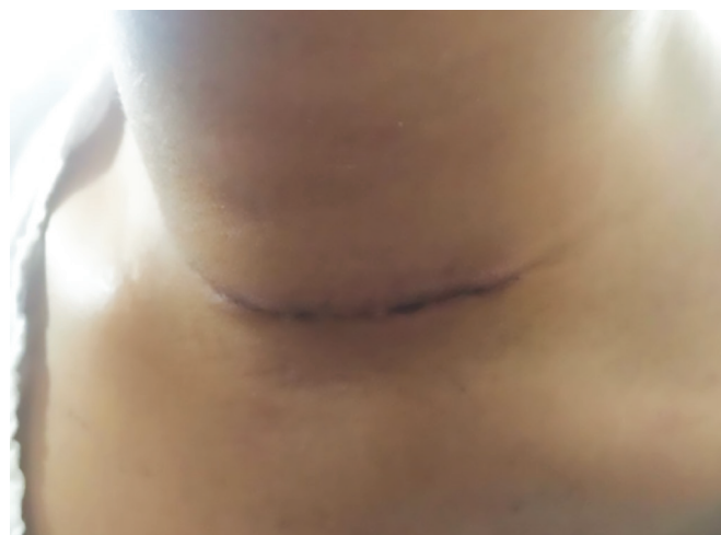
Fig. 1: A good postoperative scar

Blood supply is a significant factor in wound healing and areas of the skin with rich blood supply heal with favorable scars 5 (Fig. 1).