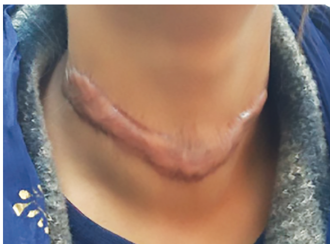
Fig. 2: Keloid after thyroidectomy

The first few days we look for erythema or inflammation (Fig. 3), and we have the adhesive strip (steri-strips) in place. We clean the wound with saline to maintain its hydration. If non-absorbable sutures are placed then they should be removed at the earliest possible to minimize scar formation. We recommend the patient to have an adhesive strip (steri-strips) placed over the incision for 2 weeks to reduce tension. Then we have a protocol of moisturizing skin cream with vitamin E 1% w/w and aloe vera 10% w/w or silicone gel based ointment which has to be applied daily. One week after incision the tensile strength across the incision is 3% but becomes 20% around 3 weeks when the remodeling begins. Silicon-based cream or silicone gel sheets are believed to decrease the size of the scar by an increase in hydration, oxygen tension and local temperature. 9 After a month we advise the patients gently massage which increases the flexibility of the scar. Massage reduces the pain explained by the gate theory and also promotes vagal activity which results in more relaxation and reduced peripheral vasoconstriction 10 (Algorithm-1).