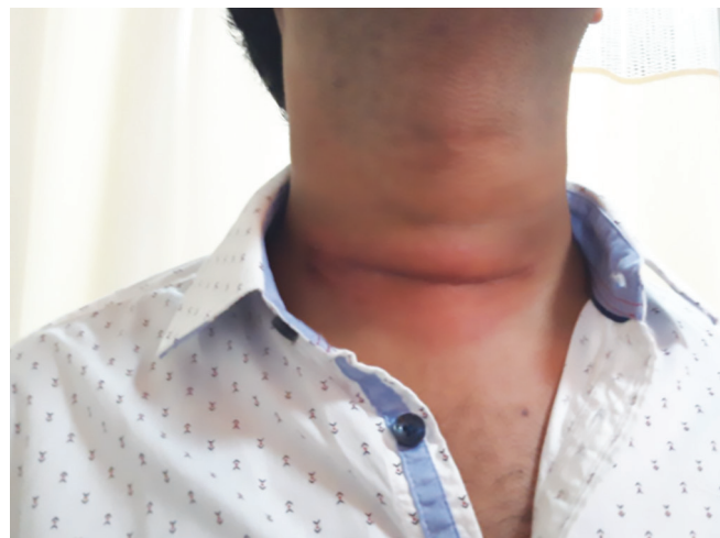
Fig. 3: Erythema postoperatively