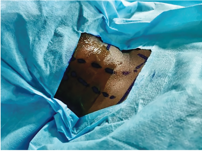
Fig. 2: Marking for superficial cervical block